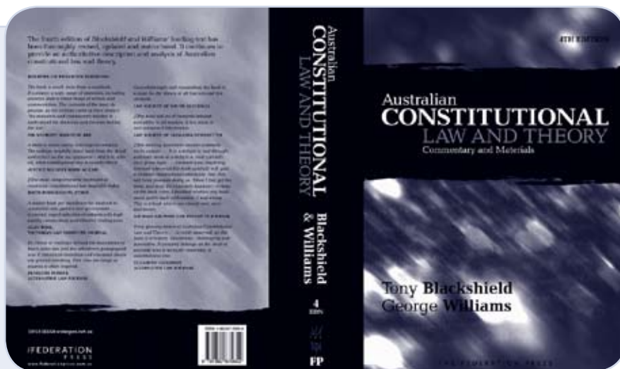
Front Cover of Australian Constitutional Law and Theory , Fourth Edition

Submission to the Australian Law Reform Commission Reference on Sedition (14 April 2006).