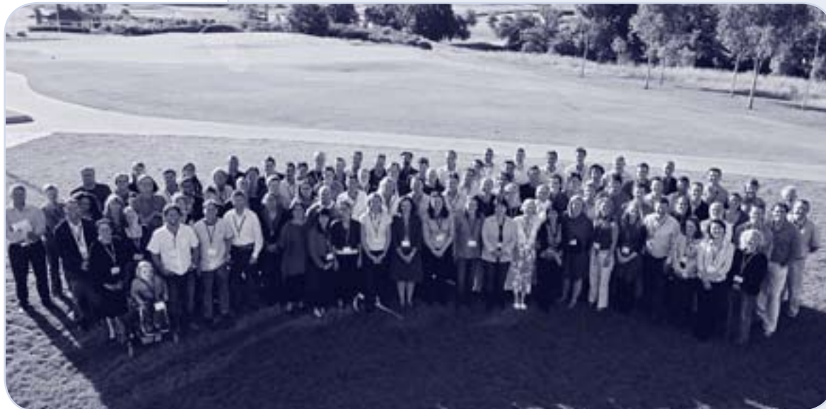
Participants at the 2006 Australian Future Directions Forum

It is no longer appropriate for the government of the day to have untrammelled power to commit Australia to new international obligations. Without greater involvement of parliament, international law can continue to be dismissed as 'foreign' to most Australians.