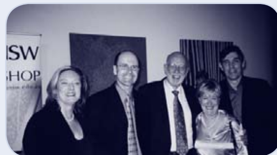
left: The UNSW Bookshop during the 2006 Constitutional Law Conference