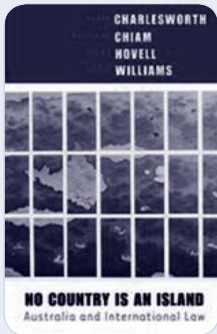
Cover of No Country is an Island: Australia and International Law